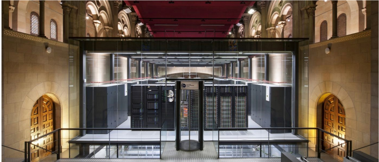
LeSI installation in the Barcelona Supercomputing Center